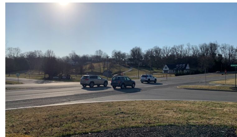
Intersection of Route 220 at International Parkway/Ashley Way